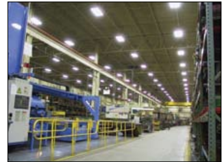
6 Lamp T-8 High Bay - After