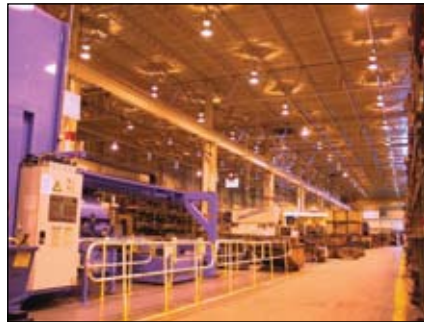
High Pressure Sodium - Before