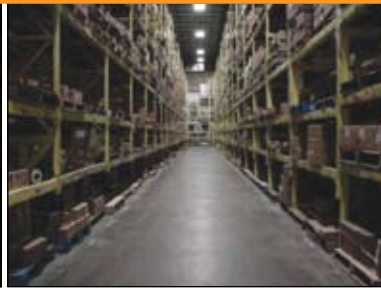
6 Lamp T-8 Freezer - After