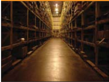
Metal Halide - Before